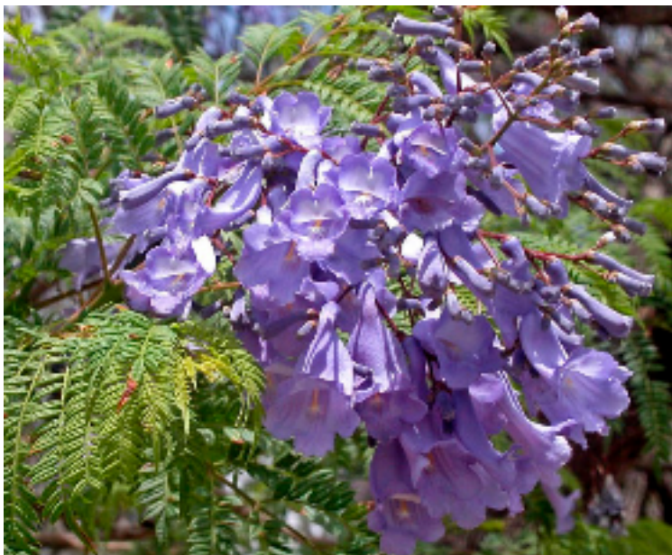
Jacaranda Tree (jacaranda mimosifolia)