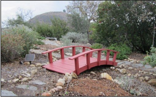
Newly painted bridge in Tranquility Garden