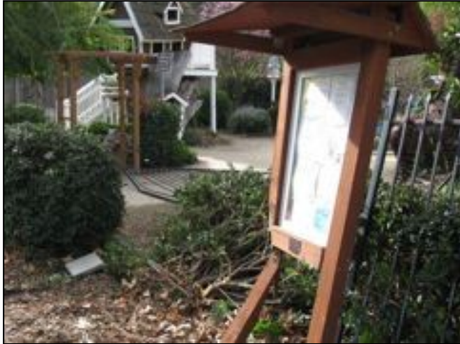
Waiting for repair