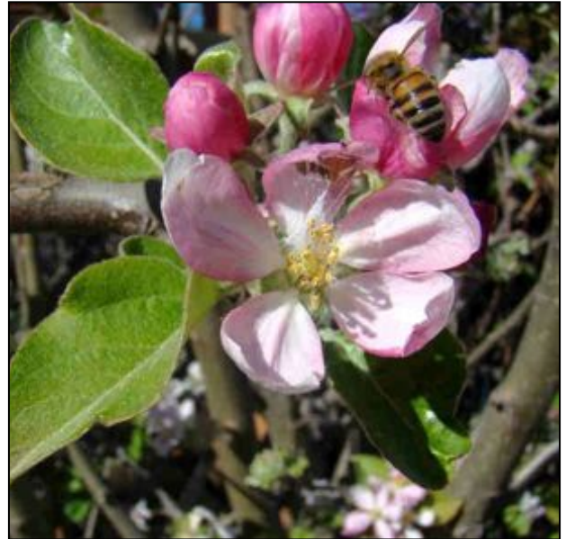
Apple blossom with bee in the Kids' Adventure Garden