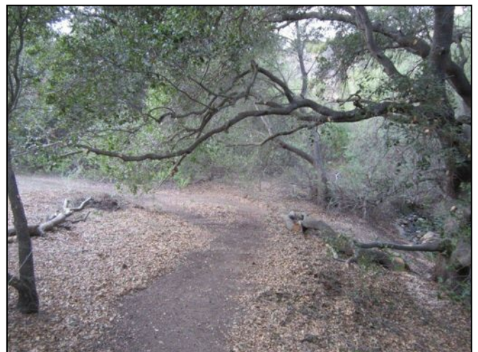
Path in the Little Loop Trail